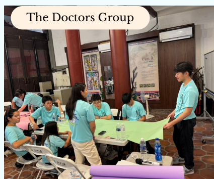
The Doctors Group